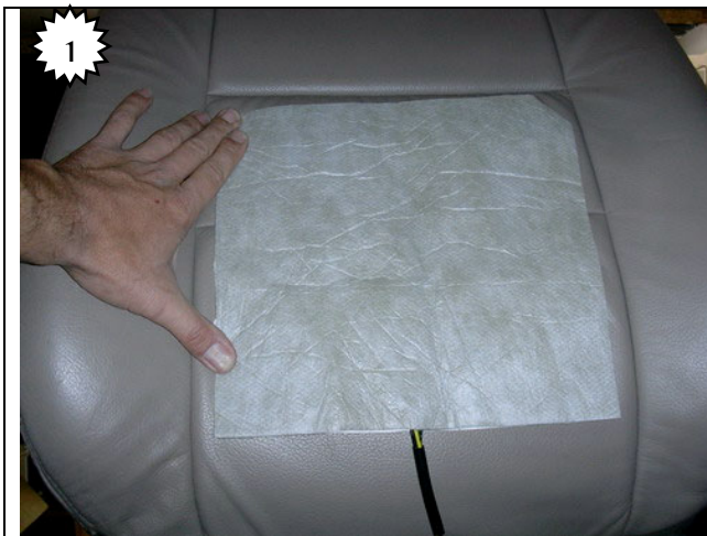
Place and verify heater location