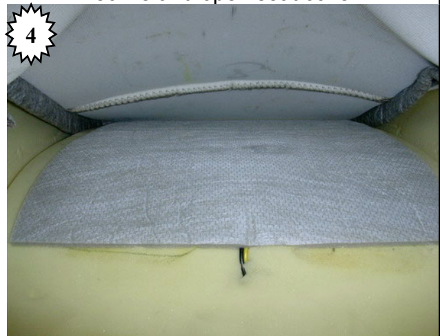
Remove adhesive backing and apply