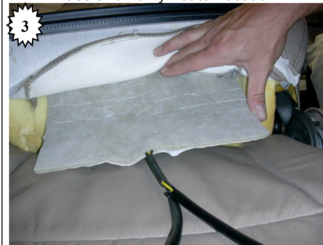
Slip in the heater element