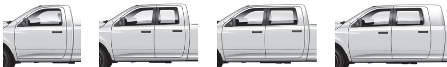
Regular Cab Quad Cab Crew Cab Mega Cab