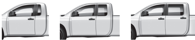
Regular Cab King Cab Crew Cab