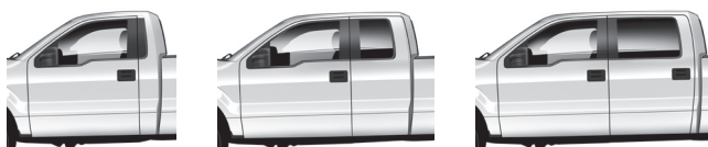
Regular Cab Super Cab (F-150/Super Duty) Super Crew (F-150/Super Duty)