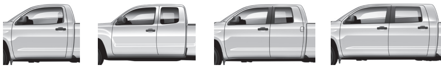
Regular Cab Access Cab (Tacoma) Double Cab CrewMax Cab