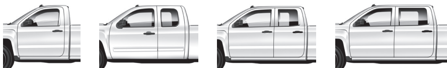
Regular Cab Extended Cab (Pre-2014) Double Cab (2014+) Crew Cab